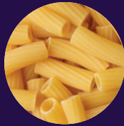
DRY FOOD APPLICATIONS